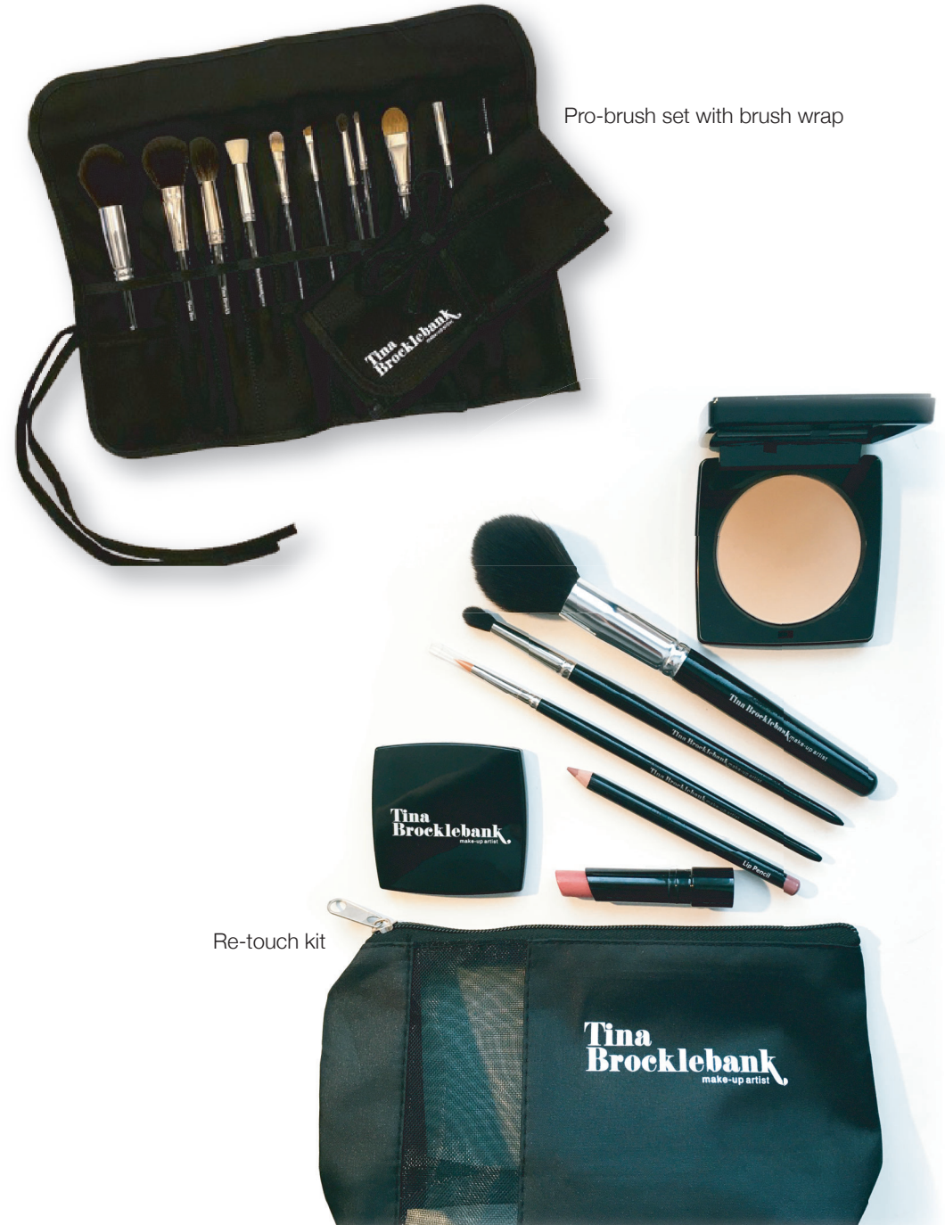
Pro-brush set with brush wrap